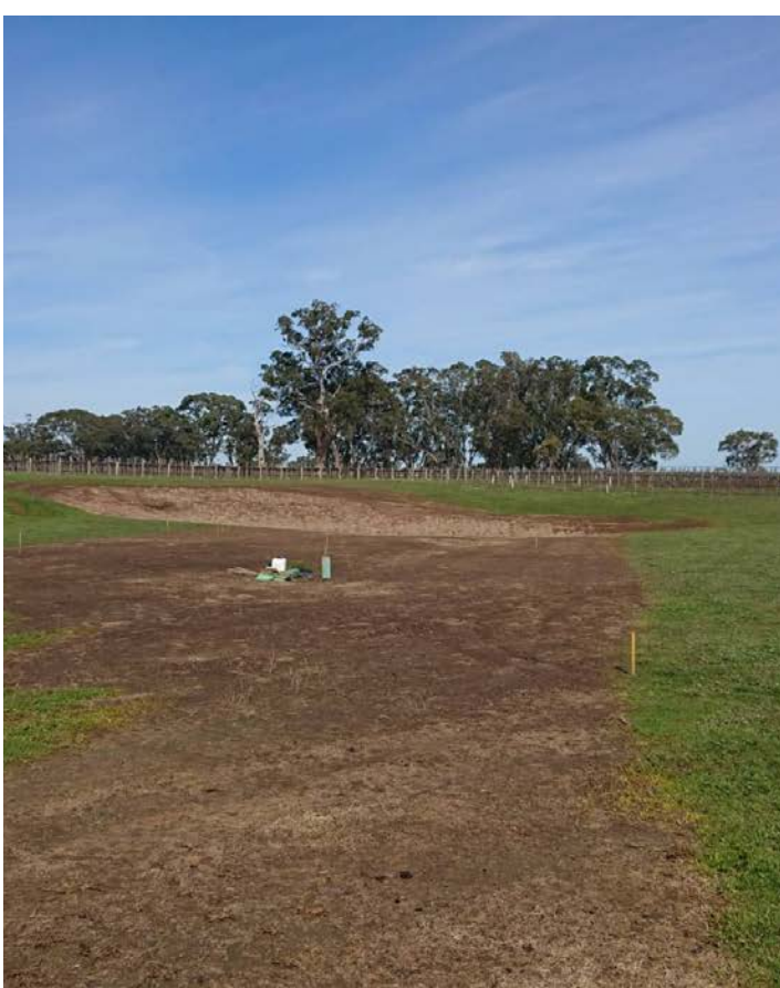
Before: July 2020 sunken cave area in the middle of the vineyard ready for preparation (left), September 2020 herbicide applied (right)