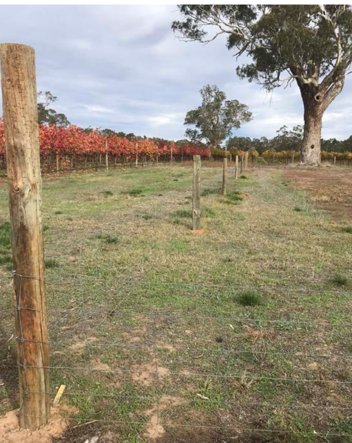
Before: May 2021 fence installed under an old paddock gum (left), and herbicide applied ready for planting understorey (right)