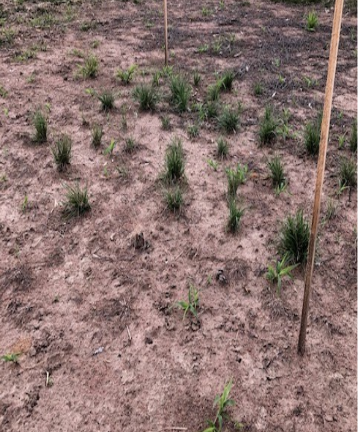
After: November 2021 plants in establishment